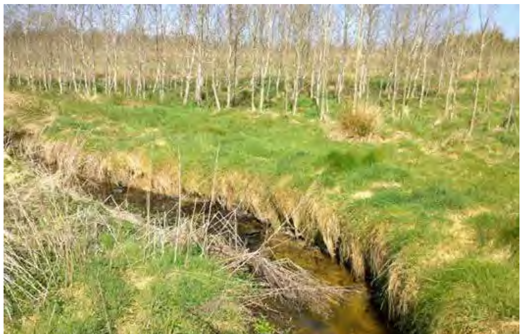
A well-established water setback adjoining a broadleaf plot.