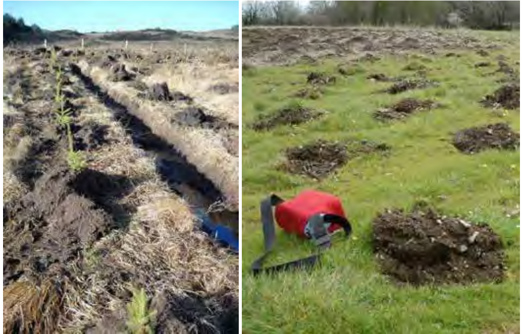
Conventional mounding (left) and invert mounding for more sensitive sites (right).

intersection between mound drains and collector drains must be offset along the length of the collector drains, to ensure that individual mound drains do not continue in long unbroken runs down the slope.