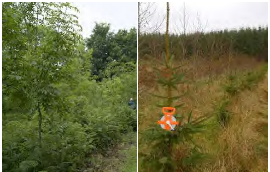
Sensitively sited, designed and established plantations adding to Ireland's expanding forest resource.