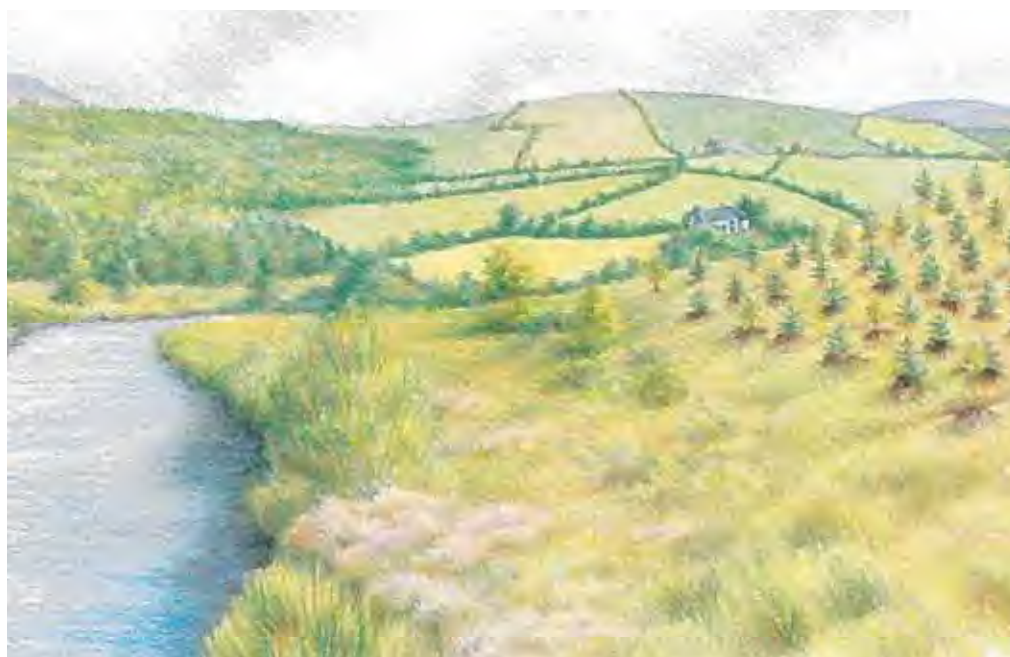
Water setbacks and setbacks from other environmental features and sensitivities are a key part of forest design. (Illustration Aislinn Adams)