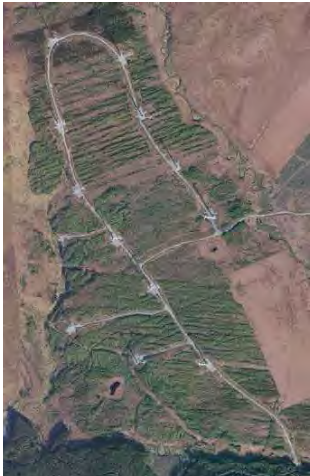
Photo 8 A wind farm within a forest plantation. Forest Service policy is to facilitate wind energy within the context of SFM and the expansion of the national forest estate.

In line with general Forest Service policy, where grant-aided forestry is to be used for wind farm development, any grants and premiums already paid out by the Forest Service in relation to the areas felled for the turbine bases, roads and infrastructure must be repaid where the forest is still in receipt of afforestation premiums and / or still in contract under the Afforestation Scheme.