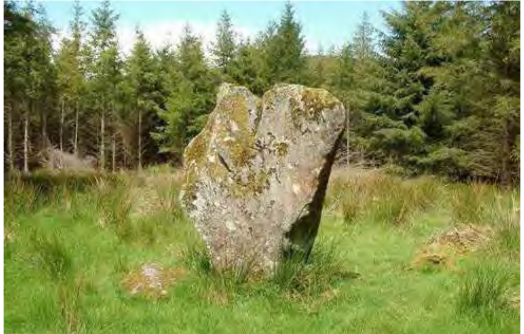
Ogham Stone, Knickeen, Co. Wicklow (Coillte property).

evident as the assessment progresses, that a proposed development is likely to have significant adverse impacts on archaeological, historical or cultural sites or features, and which in its opinion cannot be adequately addressed by conditions based on the tiered hierarchy of archaeological mitigation responses listed above, the application may be refused entirely.