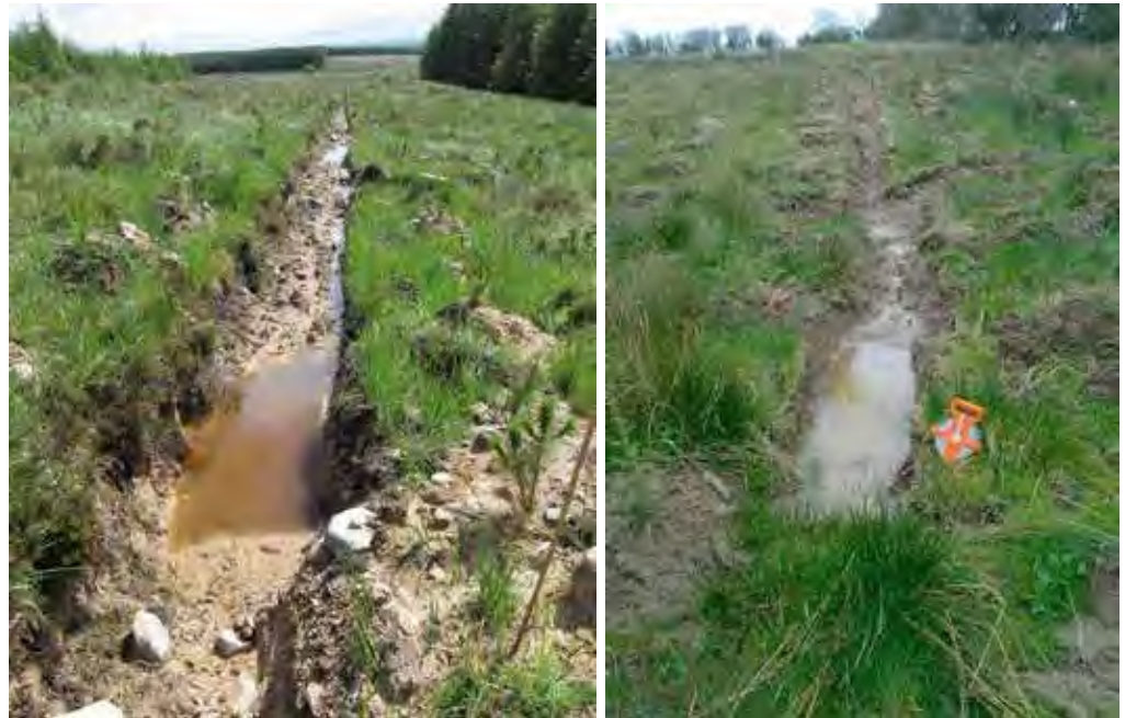
In-drain sediment trap (left) and a sediment trap adjoining a water setback (foreground) (right).

Additional safeguards include the following: