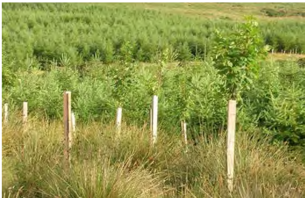
Forest edge planting, using deer shelters.