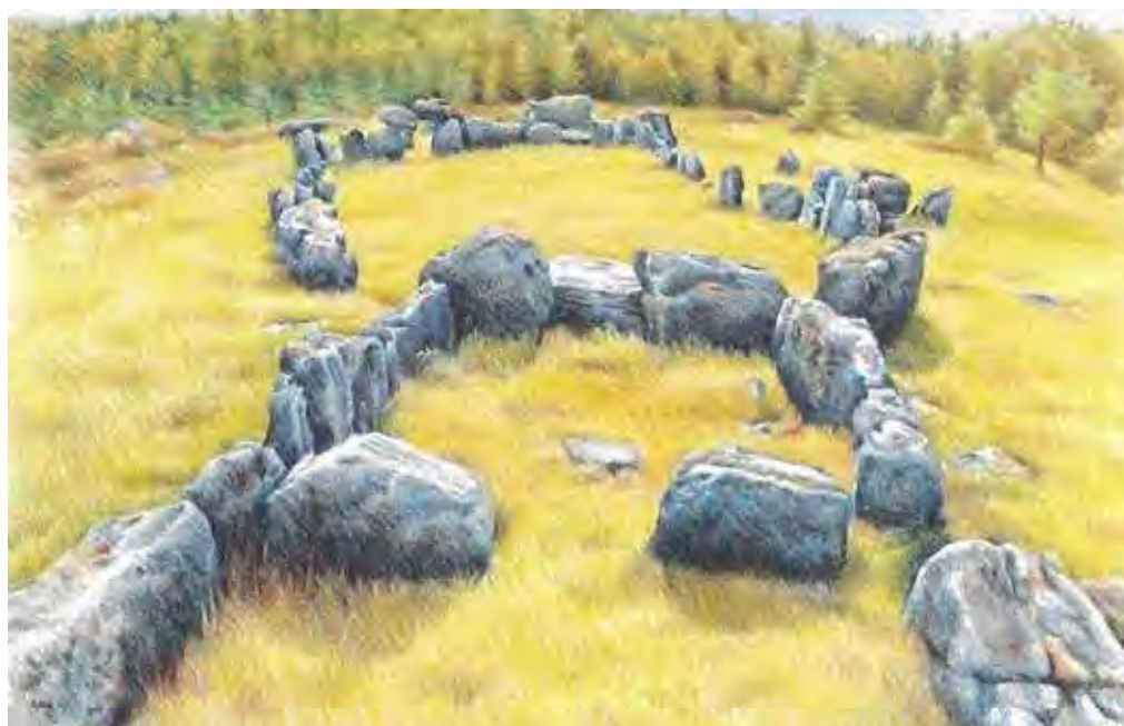
A central court tomb, Magheraghanrush or Deerpark, Co. Sligo (Coillte property). (Illustration Aislinn Adams)

Archaeological sites and monuments and other important built heritage structures and features are part